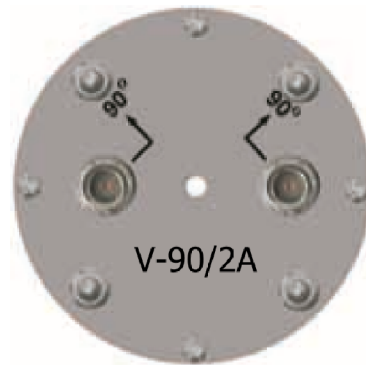
Bottom view on the antenna

Gain: 2x16 dBi Polarization: Vertical Impedance: 2x 50 Ohm Termination: 2x N-female Dimension: diameter 110 x height 550 mm Horizontal Beamwidth: 2x 90^\circ (E-plane@-6dB) VSWR: 1.5 Vertical Beamwidth: 13^\circ (V-plane@-3dB) Band (GHz): 3.4-3.6 Power: max. 10 W Weight: 2.3 kg Antenna Enclosure: PVC-U (IP55 optionally)