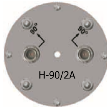
Bottom view on the antenna

Gain: 2x16 dBi Polarization: Horizontal Impedance: 2x 50 Ohm Termination: 2x N-female Dimension: diameter 110 x height 550 mm Horizontal Beamwidth: 2x 90^\circ (E-plane@-6dB) VSWR: 1.5 Vertical Beamwidth: 13^\circ (V-plane@-3dB) Band (GHz): 3.4-3.6 Power: max. 10 W Weight: 2.3 kg Antenna Enclosure: PVC-U (IP55 optionally)